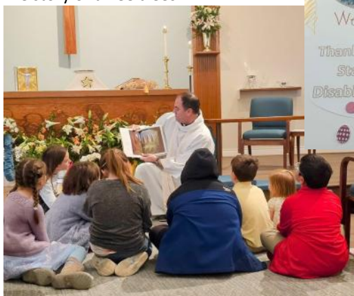
The story of three trees.